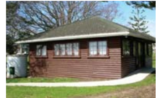
Beachlands Log Cabin

Beachlands Log Cabin is a small and very basic cabin which was originally built for residential purposes. It consists of one large room with 2 small side rooms and an old kitchen. There is an external toilet. It is located very picturesquely on the Sunkist Bay Reserve. The facility is used by local arts groups.